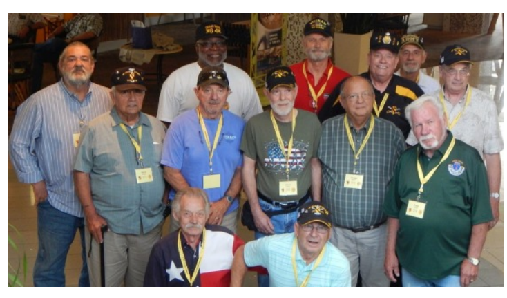
2015 - San Antonio, Recon 1965-66