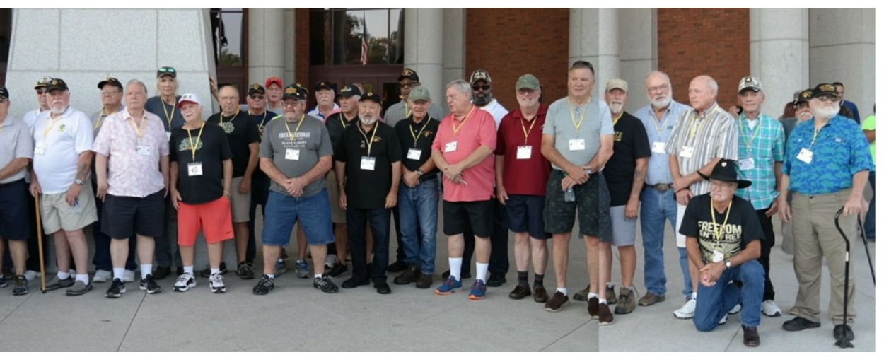
n, Columbus & Fort Benning