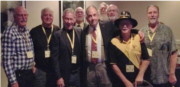
2015 - San Antonio, 1967-68