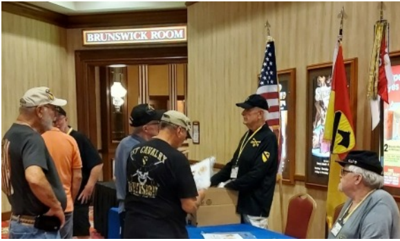
Delta Check-in at South Point