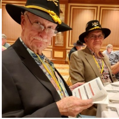
Fearless Fly and Doc Alexander