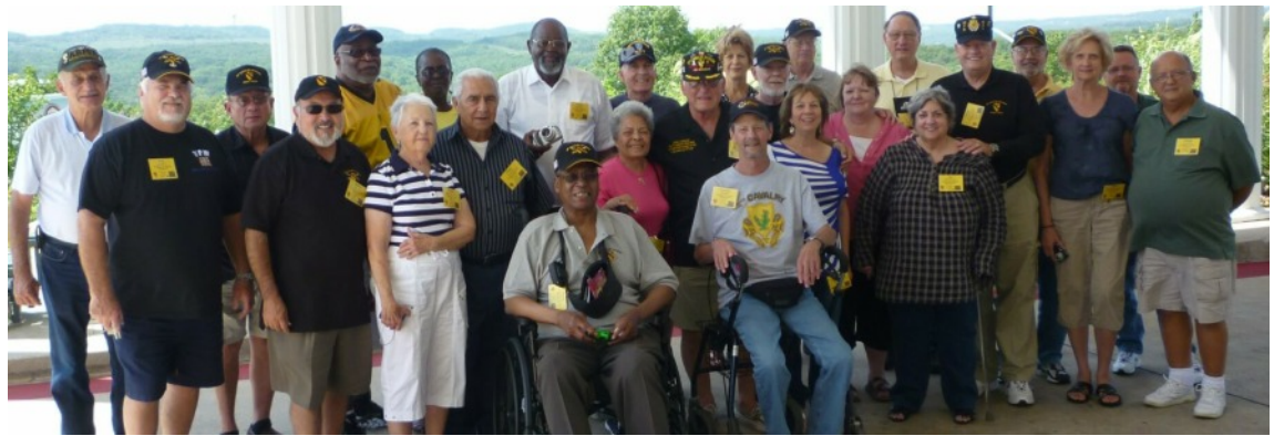
2012 - Delta at the 12th Cavalry Reunion, Branson