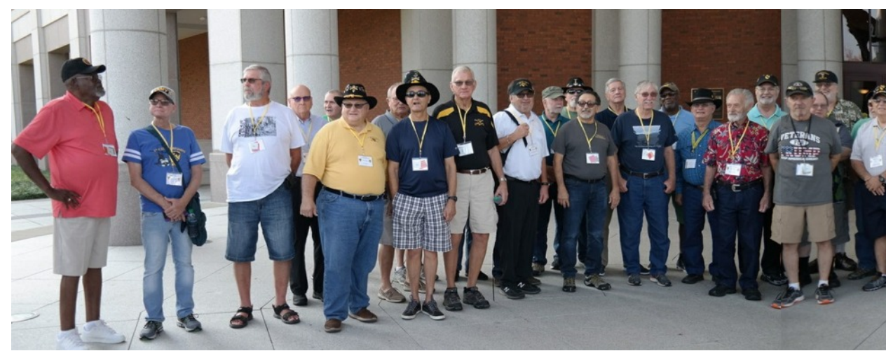
2019 - National Infantry Museur