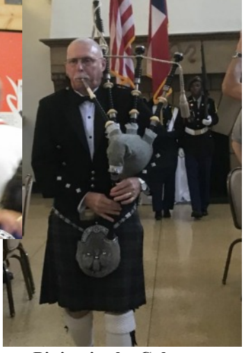
Piping in the Colors to "Garryowen" is a tradition at Delta's Reunions